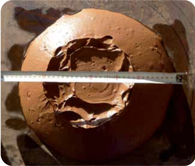
Fill without admixture