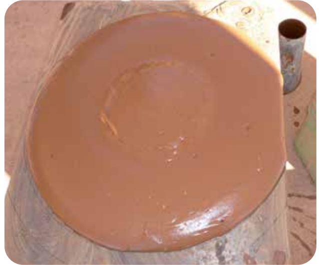
Fill with admixture

The criteria and requirements for backfilling can vary substantially, depending on the site specific requirements. Master Builders Solutions® offers an extensive range of customized solutions for all types of mine and underground backfill operations, all of which have been developed with a focus on: