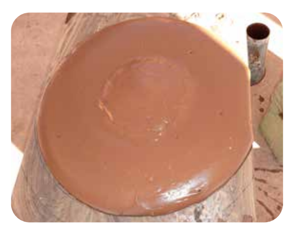
Fill with admixture