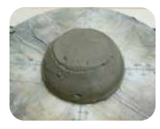
MasterRoc MG 10 -Thick Mix