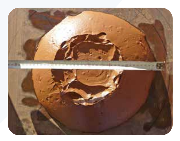
Fill without admixture

Master Builders Solutions' extensive range of mine backfilling solutions have been developed to provide the optimum balance of high early strength and sustainable long-term strength, ensuring dimensional stability after placement by meeting (or exceeding) design fill performance requirements. Depending on the site specific requirements, Master Builders Solutions offers an extensive range of customized solutions: rheology enhancers, viscosity modifiers, and hydration control as well as water reducers, superplasticizers and durability enhancers.