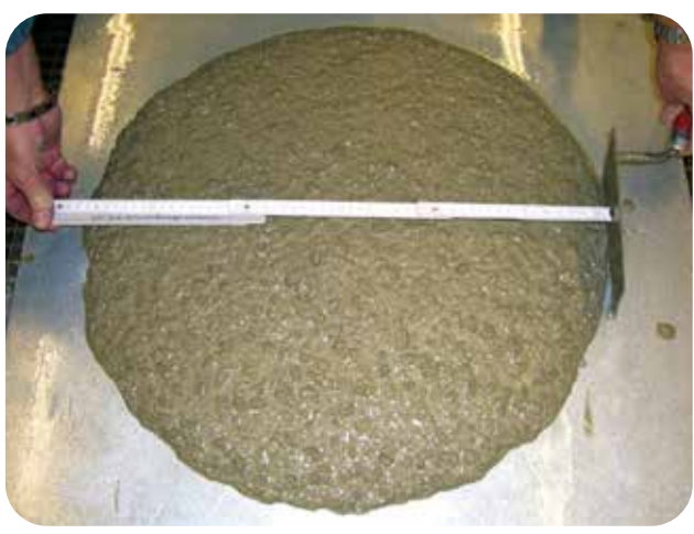
Sprayed concrete quality testing

As a consequence of the growing use of sprayed concrete as a permanent construction material for tunnel linings, demands on its durability have increased likewise. It offers more flexibility in terms of the geometry and space requirements. Permanent sprayed concrete is a requirement for the innovative composite shell lining design. See also our brochure on permanent sprayed concrete linings.