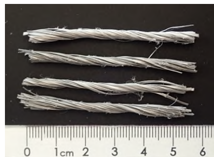
MasterFiber 320 “twisted” polyolefin macro fibers

MasterFiber 320 can also be used in place of the distribution armature (electro-welded mesh) to counteract thermohygro-metric movements.