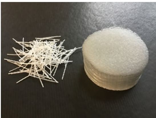
Macro synthetic fibres MasterFiber 247 SPA

In compliance with the European Regulation (EU No 305/2011 and EU No. 574/2014) the product is provided with the CE marking according to UNI EN 14889-2 and the relative DoP (Declaration of Performance).