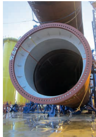
Monopile on deck