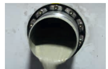
Bolted connection and grout overflow

Master Builders Solutions Product Management c/o PCI Augsburg GmbH Piccardstrasse 11 86159 Augsburg, Germany www.master-builders-solutions.com