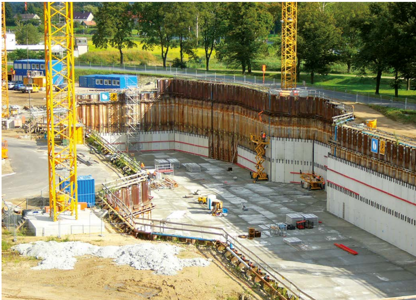
Our reference in Niederfinow (Germany): Boat lift's fundaments