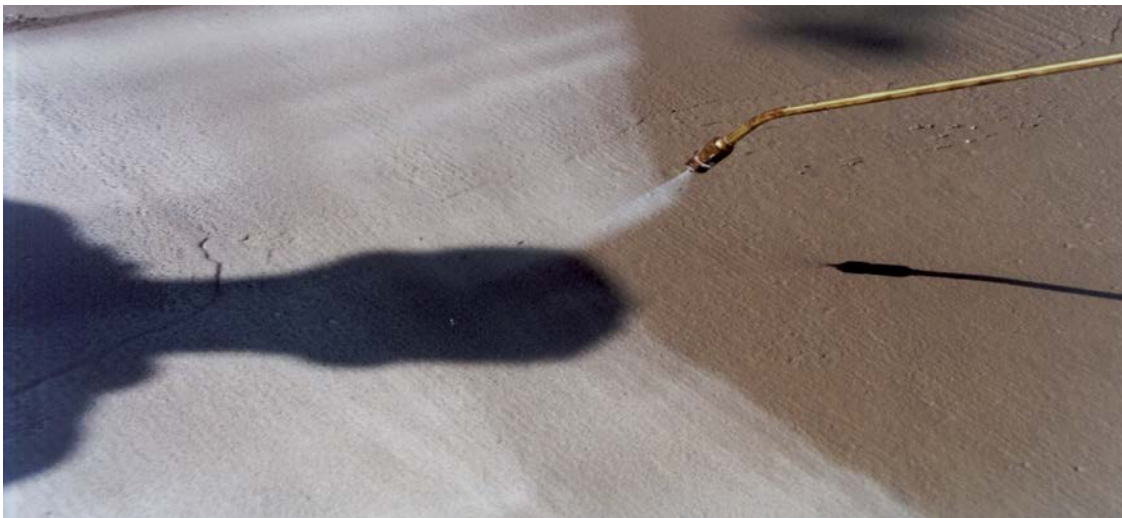
MasterKure application on construction site after placing the concrete