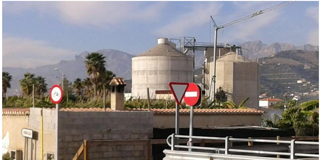
Construction of a second digester