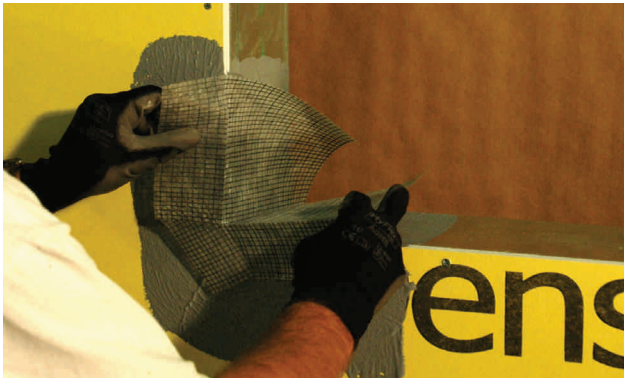
Step 3 Place the QUICK CORNER 6 on the Master Builders Solutions fluid-applied air/water-resistive barrier material.