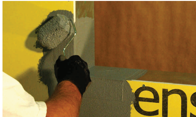
Step 4 Completely saturate the Quick Corner 6 with Master Builders Solutions fluid-applied air/water-resistive barrier material.