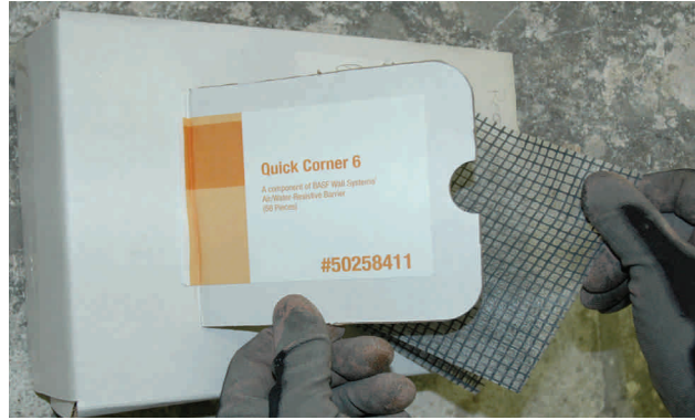
Step 2 Take a QUICK CORNER 6 from the dispenser box.