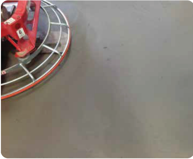
Slab on ground applications with no joints are possible using MasterLife CRA 007 admixture in conjunction with MasterFiber® macrofibers.

MasterLife CRA 007 admixture works synergistically with any of the Master Builders Solutions MasterFiber line of synthetic macrofibers to help extend joint spacing in slabs-on-ground, or in jointless slab applications.