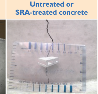
Crack width \approx 100 \, \mu \text{m} \, (0.1 \, \text{mm}) Crack width \approx 1,000 \, \mu \text{m} \, (1 \, \text{mm})