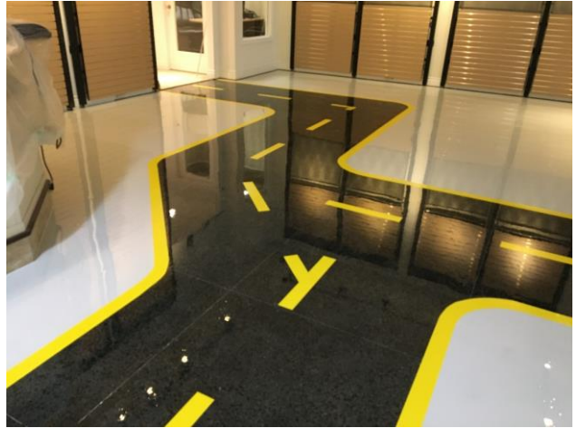
Our reference in Ottawa, ON (Canada)