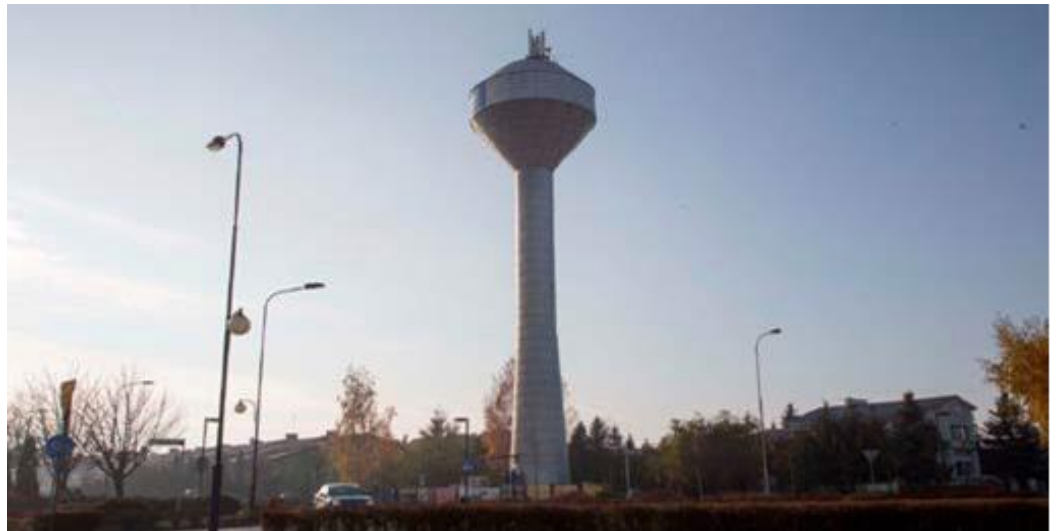
Ślupca water tower in Poland