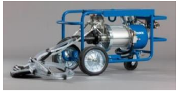
example of a two-component injection pump

Part A and B are delivered ready to use. They are injected in the proportion of 1:1 by volume using a two-component injection pump equipped with a static in-line mixer nozzle, as shown below: