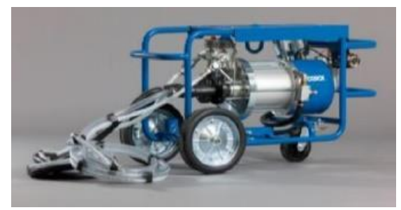
example of a two-component injection pump

Highly reactive, two component hydrophobic polyurethane injection resin for strata consolidation