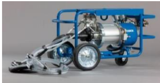
example of a two-component injection pump

Part A and B are delivered ready to use. They are injected in the proportion of 1:1 by volume using a two-component injection pump equipped with a static in-line mixer nozzle, as shown below: