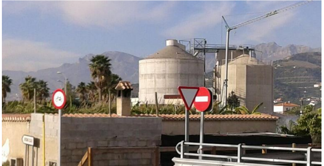
Construction of a second digester