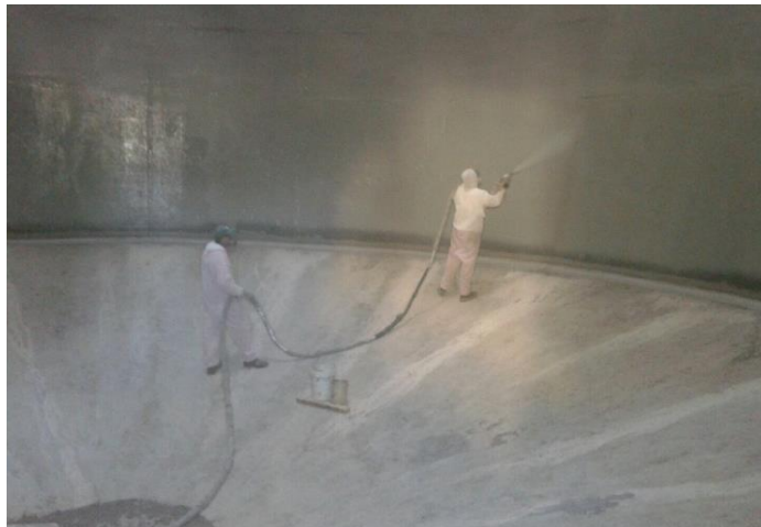
Application of MasterSeal M 689 polyurea waterproofing and protection membrane.