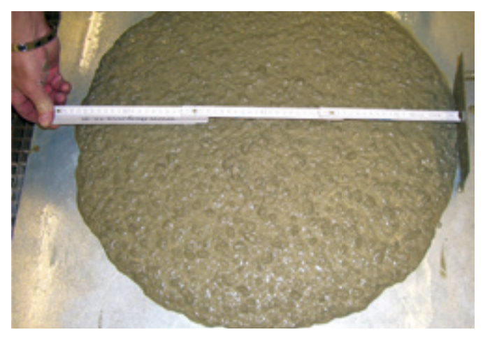
Sprayed concrete quality testing

demands on its durability have increased likewise. It offers more flexibility in terms of the geometry and space requirements. Permanent sprayed concrete is a requirement for the innovative composite shell lining design. See also our brochure on permanent sprayed concrete linings.