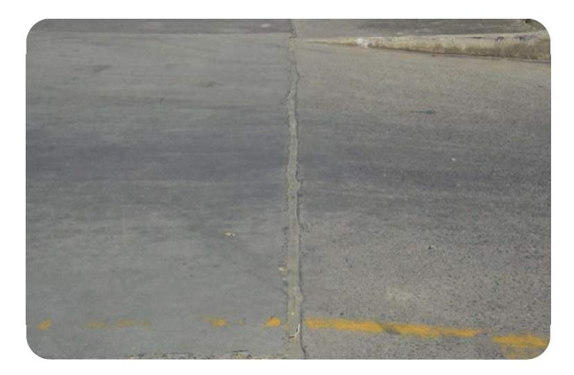
The repaired joint outside MB Solutions Seven Hills warehouse driveway