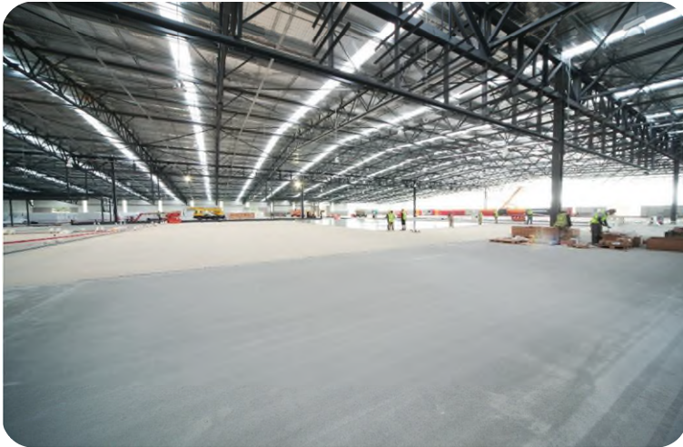
Lion Nathan East Tamaki Brewery