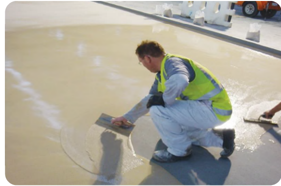
Application of Ucrete DP in the beer processing area and packaging room